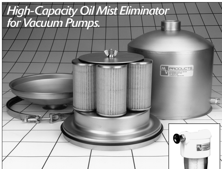
MV VISI-MIST Oil Mist Eliminator for Smaller Pumps

High-Capacity Oil Mist Eliminator for Vacuum Pumps.