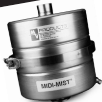
Oil Mist Eliminators