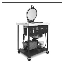
Vacuum Degassing Chambers