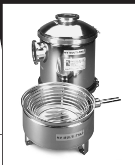
Vacuum Inlet Traps