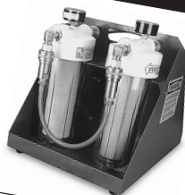
Oil Filtration Systems

MV Products offer you a full line of oil mist eliminators, vacuum inlet traps, oil filtration systems and other quality vacuum products designed to assure your vacuum pumps a long life and you a clean and healthy environment.