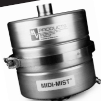
Oil Mist Eliminators