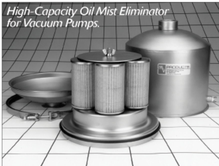
MV VISI-MIST Oil Mist Eliminator for Smaller Pumps

High-Capacity Oil Mist Eliminator for Vacuum Pumps.