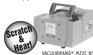
VACUUBRAND® MZ2C NT

Scratch the circle below, and you'll hear a sound just a little quieter than VACUUBRAND oil-free pumps in operation. These whisper-quiet, ultra-low maintenance pumps are welcome partners for lab use and OEM applications.